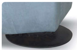
BASE: SWIVEL & GLIDER MOVMENT

LEATHER COLOR SHADE DIFFERENCES: The model upholstered with some Natural leather such as Maya, Moss, Carees and Sensation, could present in some area differences in color tones of about 5%. Such differences are not to be considered defect but an expression of the natural characteristic of the cowhide. The company reserves the right without prior notice to make technical sheets changes and/or materials for quality product improvement. Leather sofas are a handmade product and according to the leather covering selected there could be a measurement tolerance of about 2 inches (cm 5) on each sku. REV. 020 DEL 05/10/2023 | Pag. 3 of 3