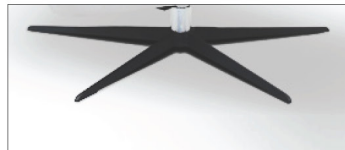
OPTION 2: STAINLESS STEEL BASE TITANIUM FINISHING