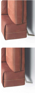
FOOT OPTION 1: STAINLESS STEEL FINISHING