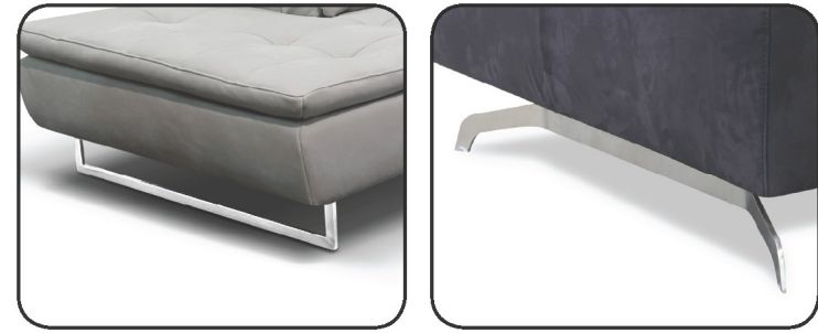
FOOT OPTION 1: STAINLESS STEEL SLED FOOT OPTION 2: STAINLESS STEEL SLED